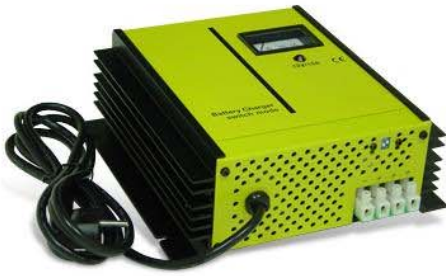
EC-315 : 12V/15A