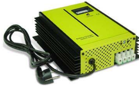
EC-330 : 12V/30A