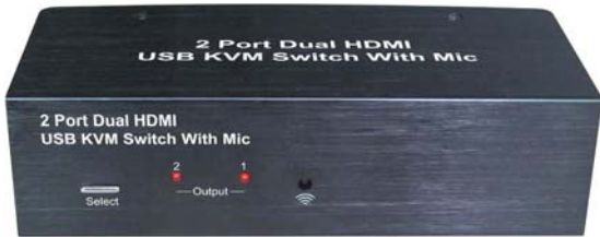
MHC224 Front View