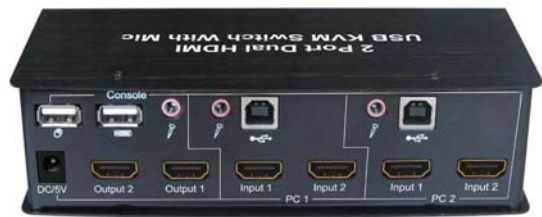
MHC224 Rear View