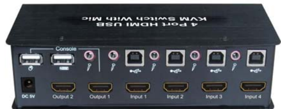
MHC424 Rear View