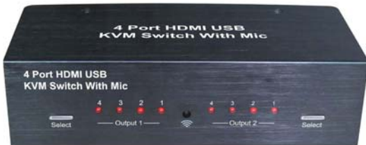
MHC424 Front View